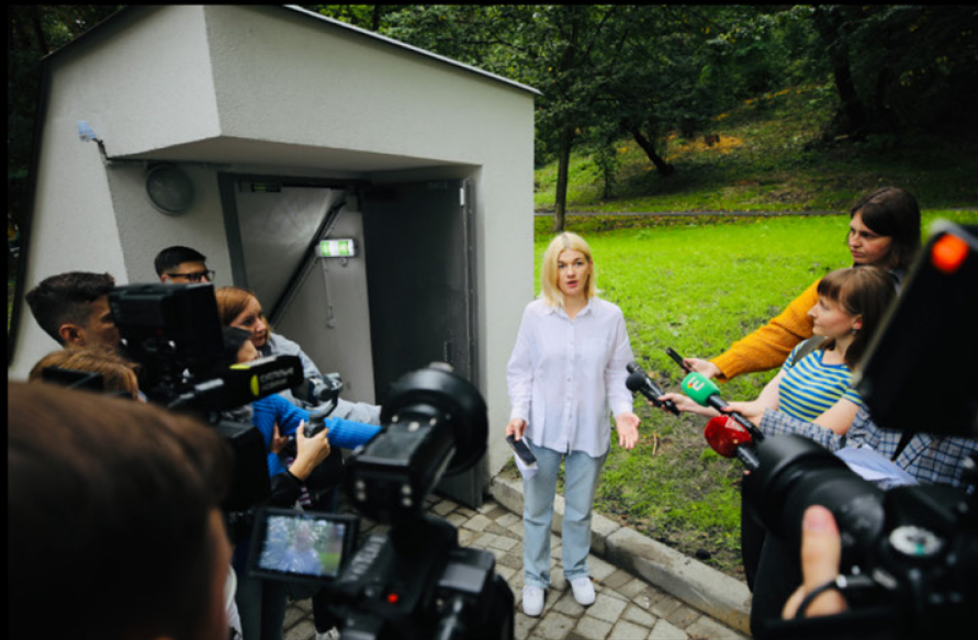
Shelters with an automatic door opening system