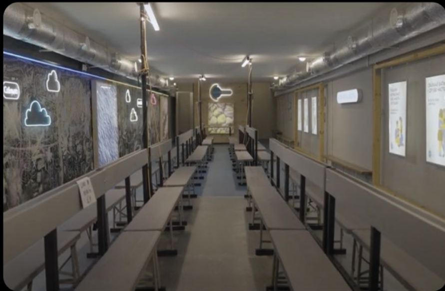
Prompt alerts solution for schools