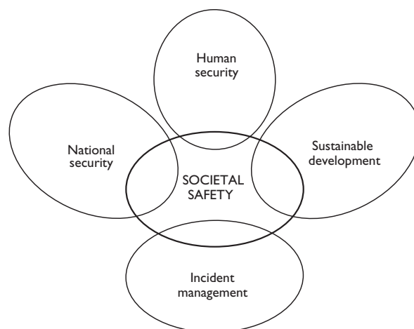
Figure 2: Societal safety and other security- and safety-related areas 21

However, the difficulty with such a broad approach is that because it contains all aspects related to security and safety in society, it is difficult to grasp and use. 20